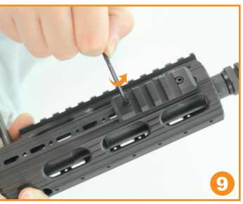
For the 4 user-configurable Picatinny rail sections included in the product, use the 2.5mm Allen wrench and M3.5 Locking Screws to install to any desired locations on the handquard rail.