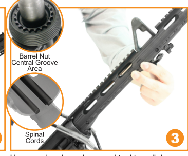
Place the Top Rail Cover over the Barrel. Make sure the front (non-tapered side) of the Top Rail Cover is tilted slightly towards the barrel, the square cut-out of the rail passes freely over the front sight post, and the round front cap is enclosed and seated into the inner cut of the Top Rail Cover as shown in image.

Use your handguard removal tool to pull down the Delta Ring. While holding the Delta Ring down, align the Top Rail Cover properly with the upper receiver using the top rail as an index. Gently press the Top Rail Cover onto the round front cap while ensuring that the Spinal Cords at the rear end mate correctly with the Central Groove Area of