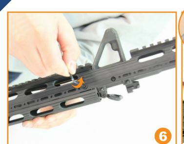
Check that the Top Rail Cover and the Rear Bottom Cover align with each other. Use the supplied 2.5mm Allen wrench and 4 of the M4 Locking Screws(2 on each side) to fasten the Top and Rear Bottom Covers