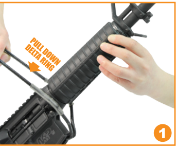
Use a handguard removal tool to pull down the Delta Ring and remove the handquard.

Note: NEVER use power tools for any fastener installation. Always hand-tighten screws with appropriate Allen wrenches included with the product. Do not over tighten any screw. If desired, apply a small amount of locking compound to the threads prior to tightening.