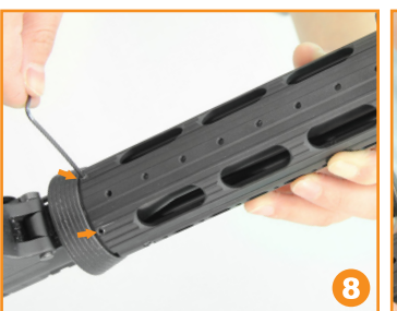
Fit 2 of the M4 Delta Ring Locking Screws into the pre-threaded holes at the Delta Ring end of the Rear Bottom Cover. Use the supplied 2mm Allen wrench to further secure the rail system.