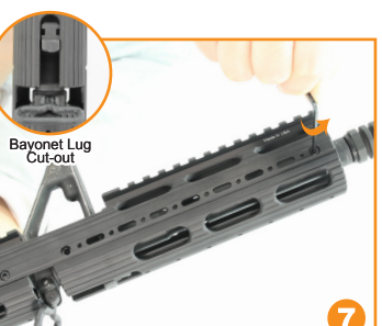
To install the Front Bottom Cover, find the end with the cut-out to fit over the bayonet lug and align its screw holes with those of the Top Rail Cover. Fasten both parts together with 4 additional M4 Locking Screws(2 on each side).